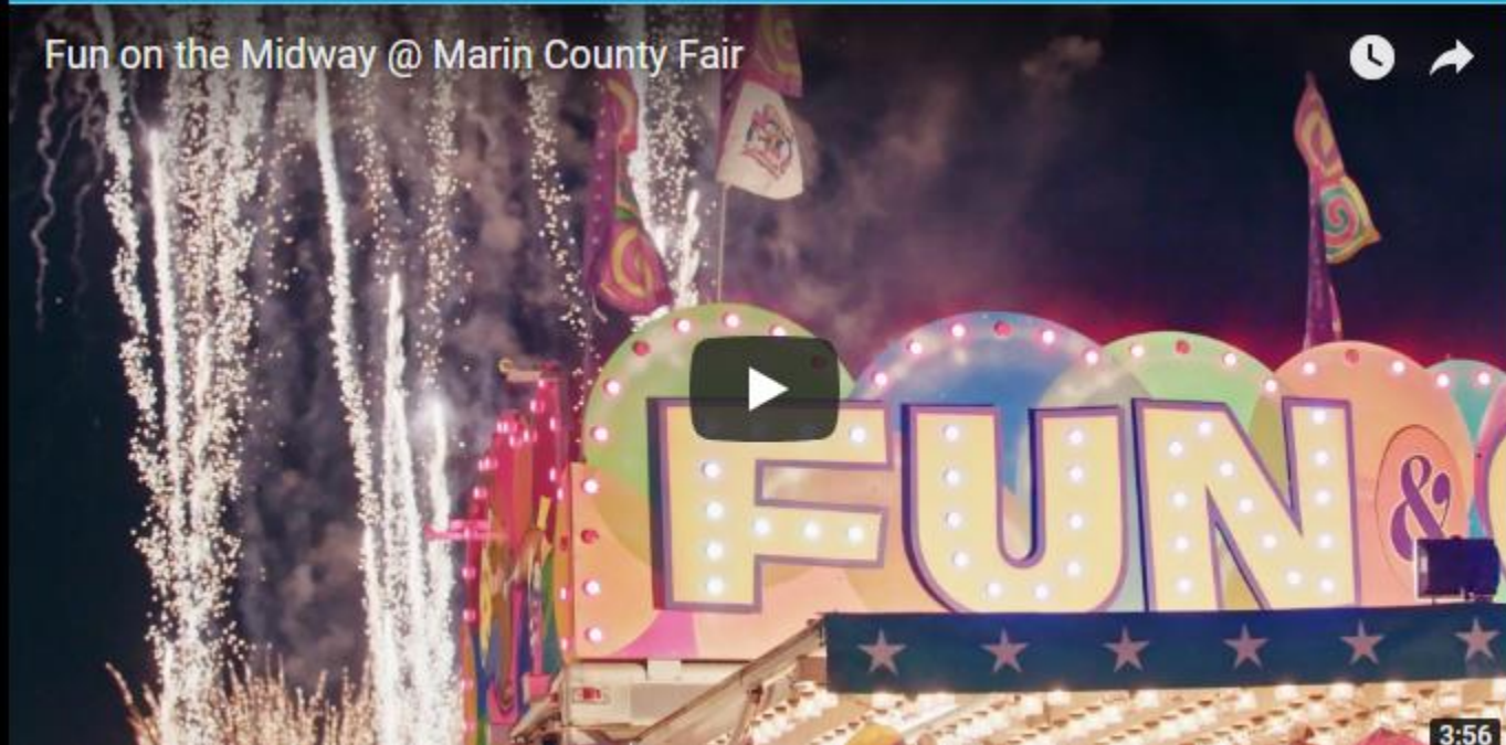
Fun on the Midway @ Marin County Fair